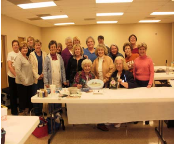
Thanks Rita for taking the group picture.